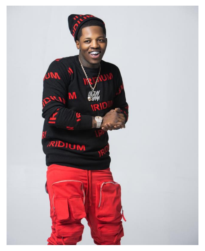
DOWNLOAD PRESS PHOTO HERE