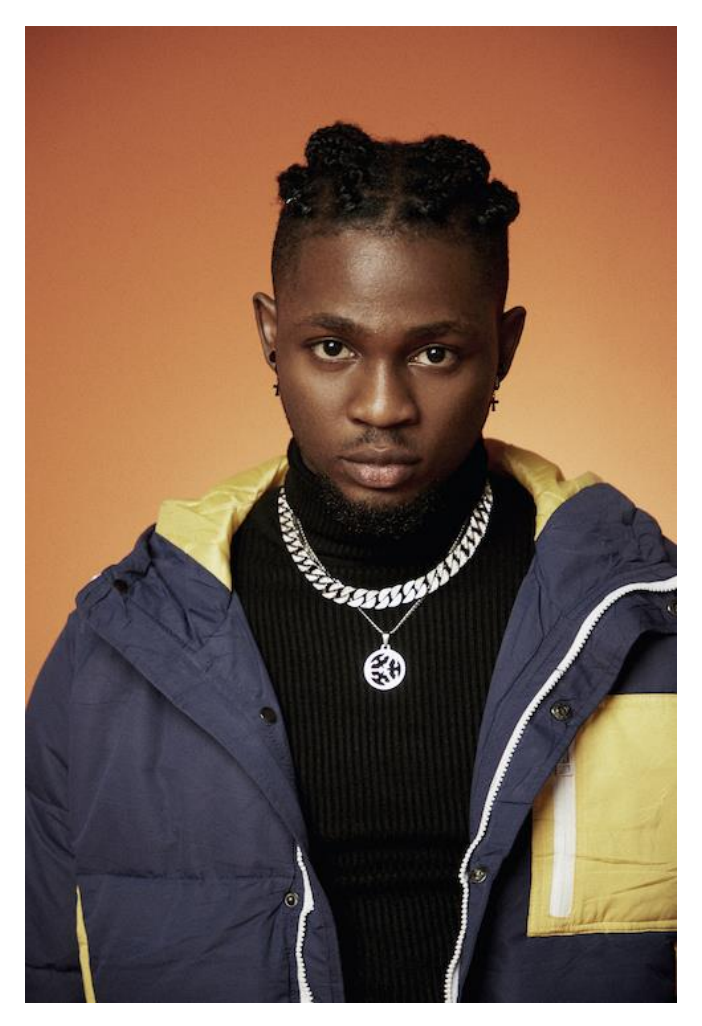
DOWNLOAD PHOTO HERE

border-hopping moment. "Damn" featuring 6lack is just a taste of what's coming. Stay tuned for What Have We Done.