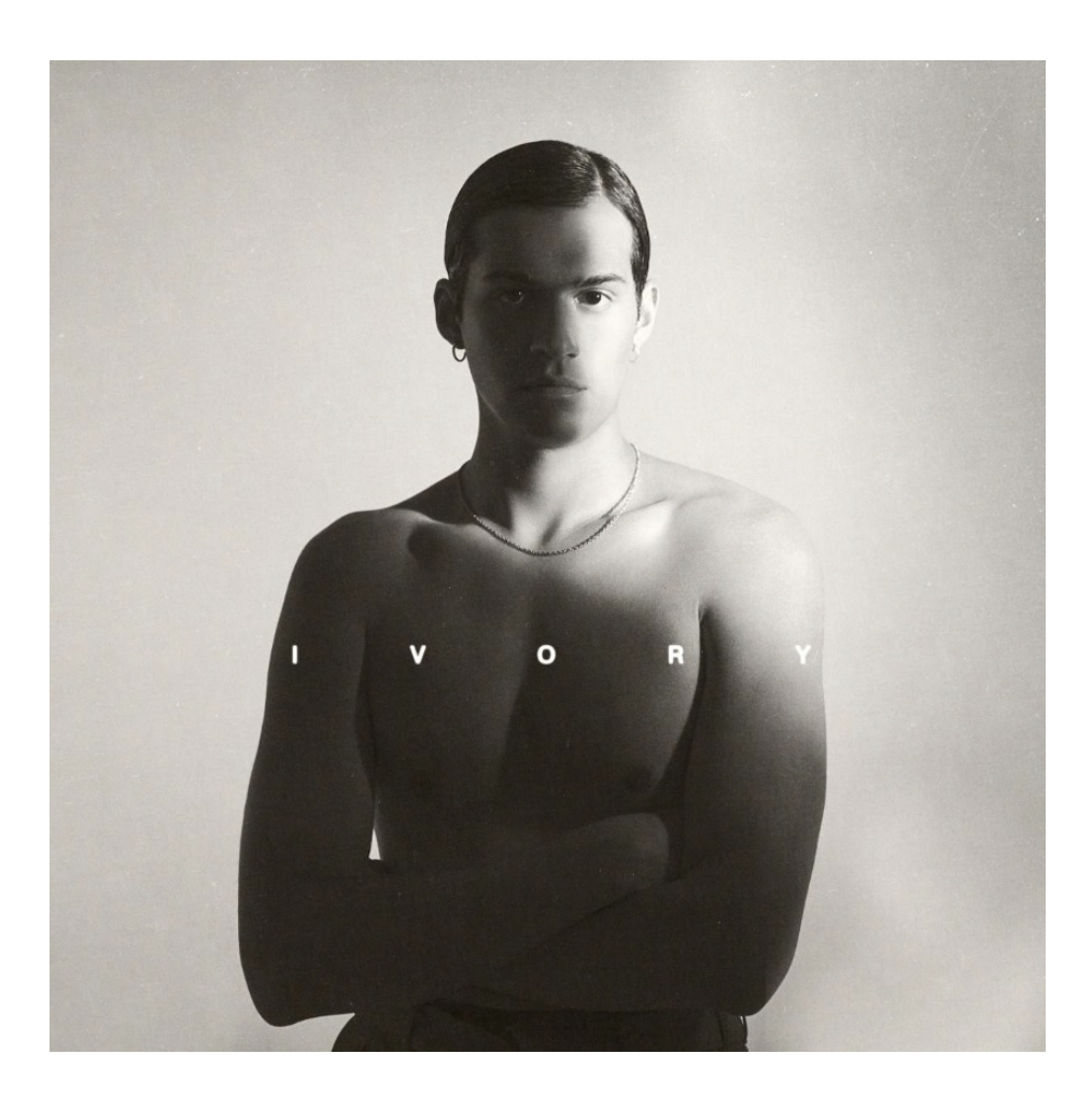
DOWNLOAD ALBUM ART HERE