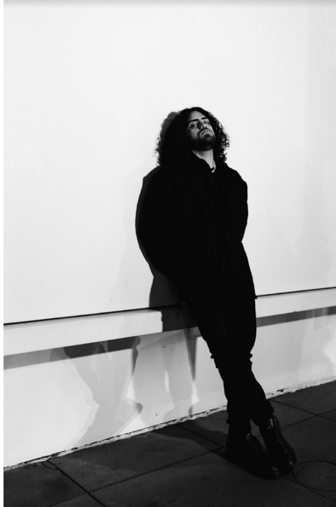
High Res Assets HERE