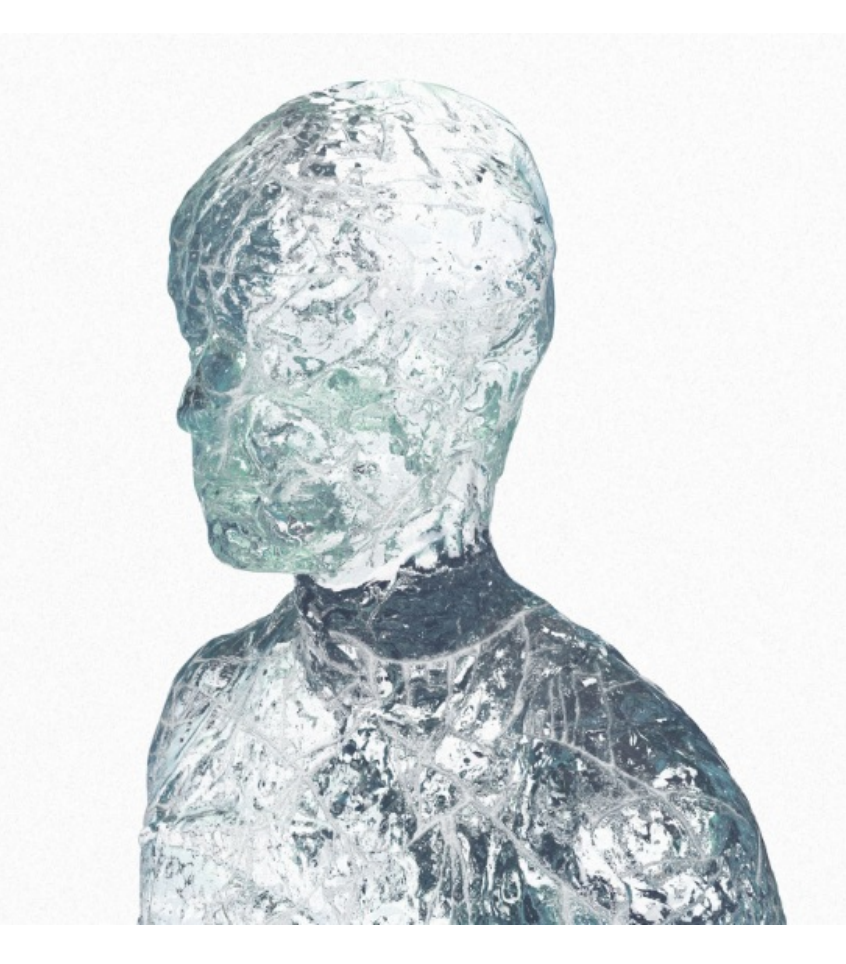
DOWNLOAD PRESS IMAGE HERE

by Joji himself, digs deeper into the lo-fi and off-kilter sounds that hark back to his experimental beginnings as an artist.