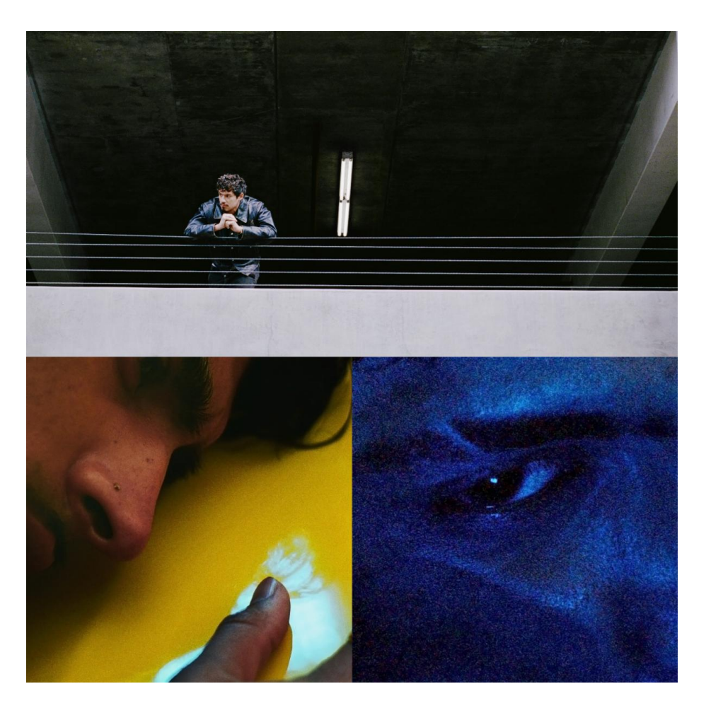
DOWNLOAD HI-RES HERE

making restlessly omnivorous music that feels damn close to the pop of tomorrow. – Rolling Stone