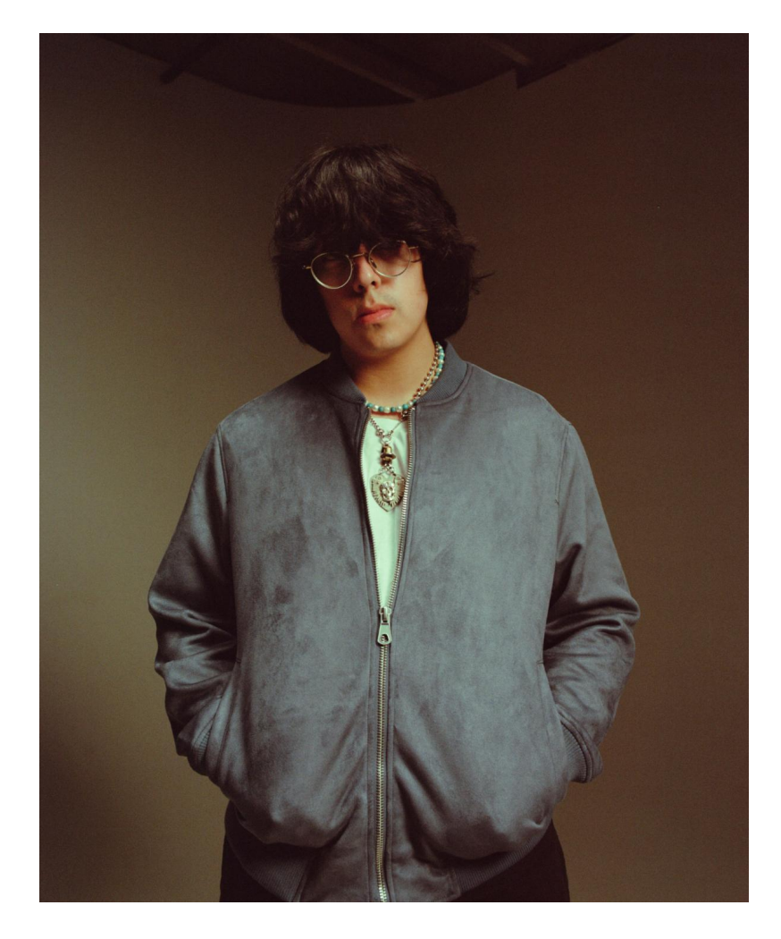
DOWNLOAD IMAGE HERE

SoundCloud and broke into the top 25 of the SoundCloud charts.