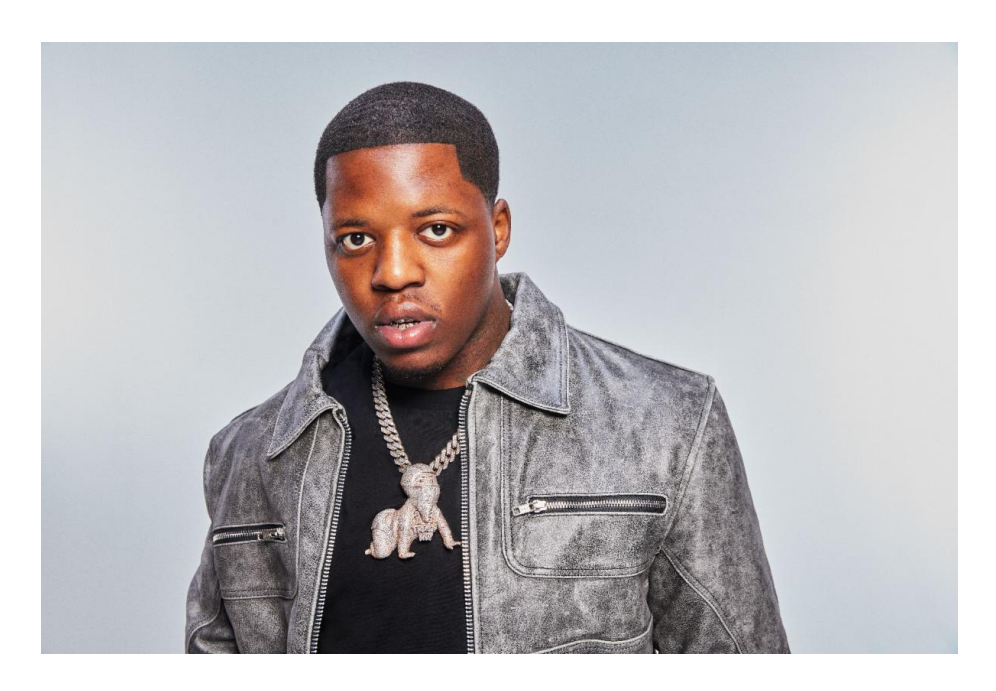
DOWNLOAD PRESS PHOTO HERE