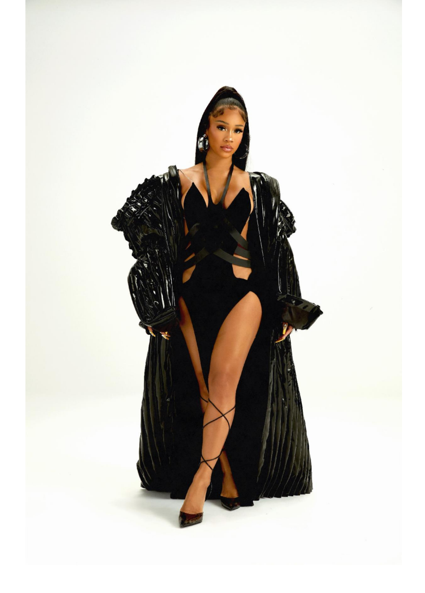
DOWNLOAD PRESS PHOTO HERE