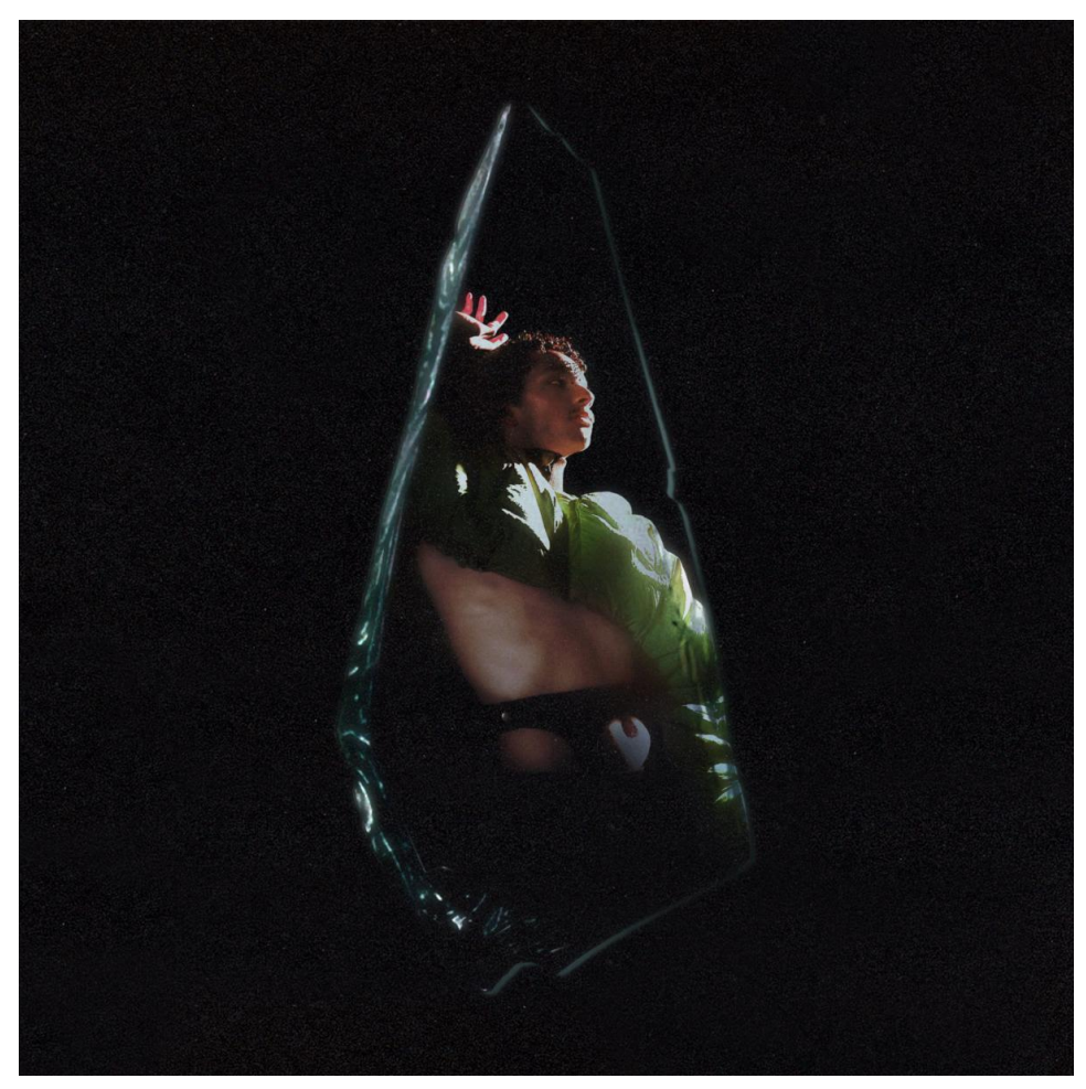
DOWNLOAD ART HERE