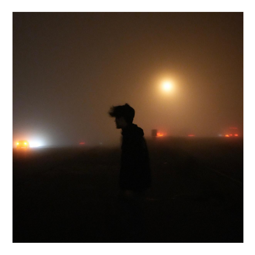
DOWNLOAD ART HERE

January 29, 2024 (Los Angeles, CA)— Rising artist-producer 1nonly releases the hypnotic new single "Scars." Listen <u>HERE</u> and watch <u>HERE</u> via Warner Records. Dense and evocative, the propulsive track finds the Las Vegas native scaling new heights in both artistry and lyricism. "Scars" is the breakout rapper's much-anticipated first release of 2024.