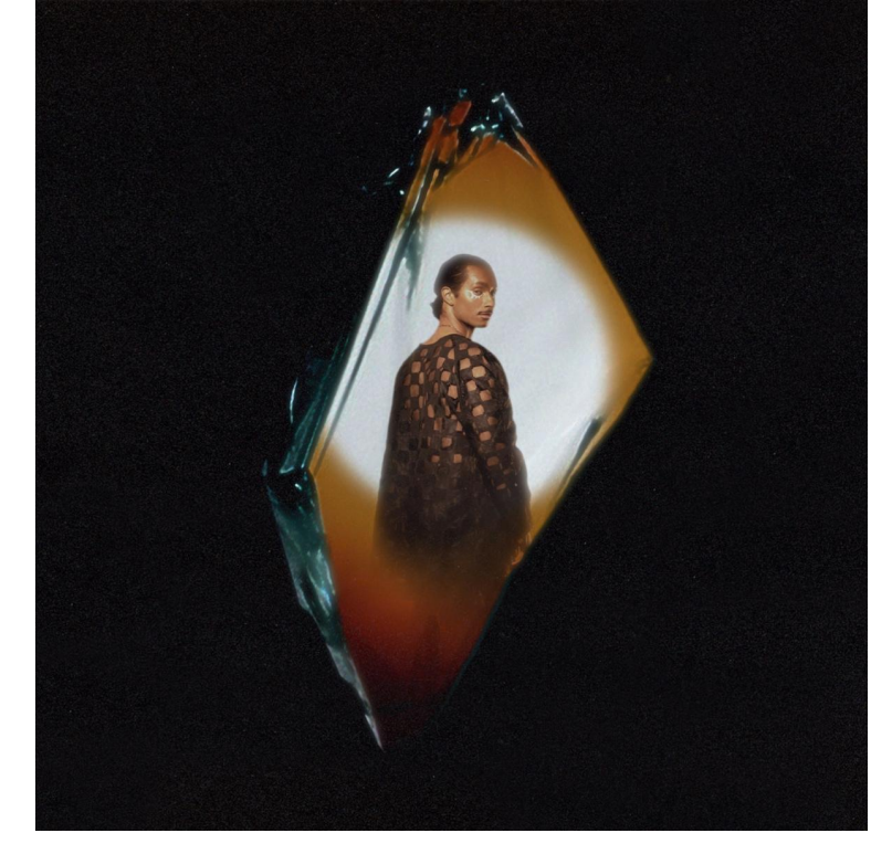
DOWNLOAD "GOLD" ARTWORK HERE